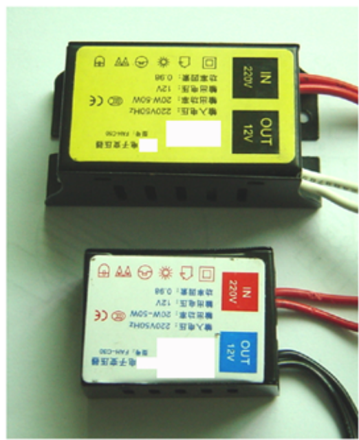
Output: only 8~9V